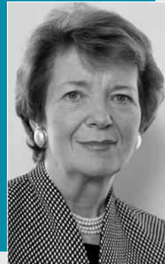
Mary Robinson, former president of Ireland, former UN High Com- missioner for Human Rights, and founder of Realizing Rights: The Ethical Globalization Initiative