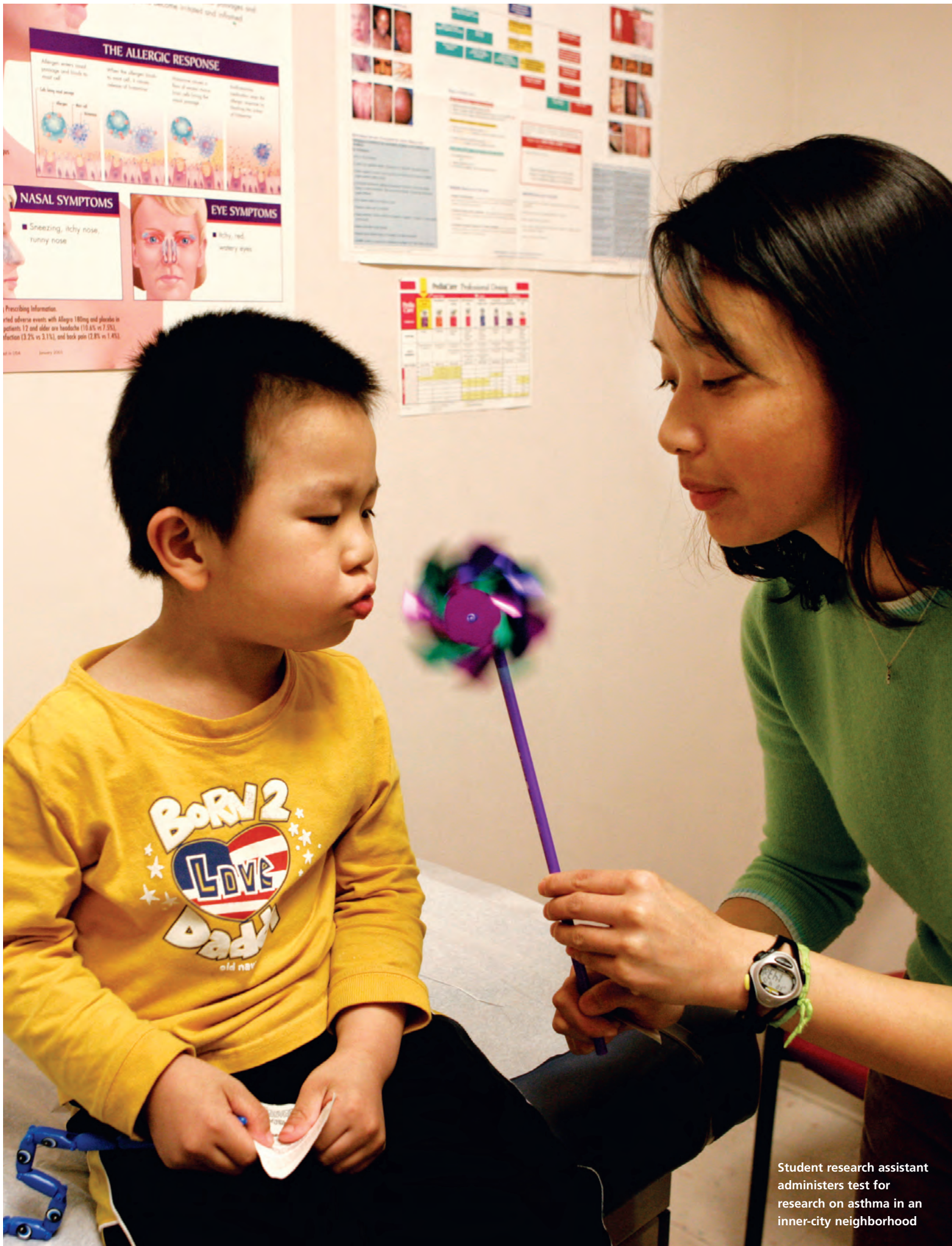
Student research assistant administers test for research on asthma in an inner-city neighborhood