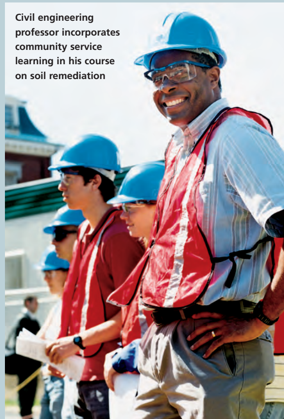
Civil engineering professor incorporates community service learning in his course on soil remediation

This statement, which has been endorsed by the entire group, argues that because of research universities' significant academic and societal influence, world-class faculty, outstanding students, state-of-the-art research facilities, and considerable financial resources, they are well-positioned to drive institutional and field-wide change relatively quickly and in ways that will ensure deeper and longer-lasting commitment to civic engagement among colleges and universities for centuries to come. To advance this process, the group developed a set of recommendations as to what research universities can do to promote engaged scholarship at their own institutions, as well as across research universities, and ultimately, all of higher education.