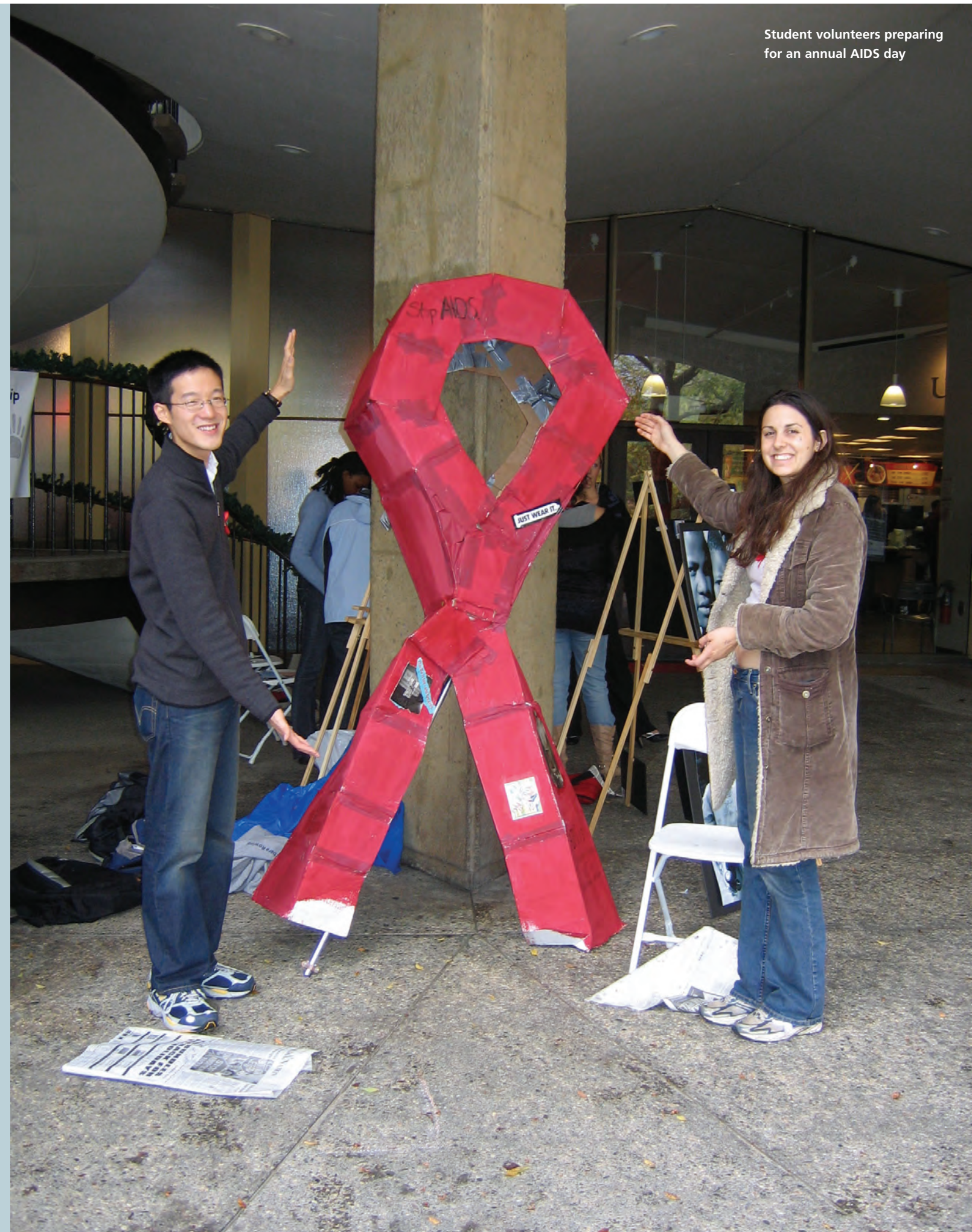
Student volunteers preparing for an annual AIDS day

Woodrow Wilson National Fellowship Foundation Responsive Ph.D. Initiative (2004). Retrieved on June 19, 2006 at http://www.woodrow.org/responsiveph/agenda.html .