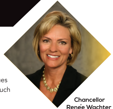
Chancellor Renée Wachter